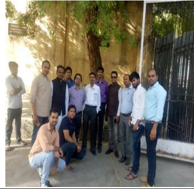
Pre Planning Of RAYM at NIA Jaipur (Rajasthan)